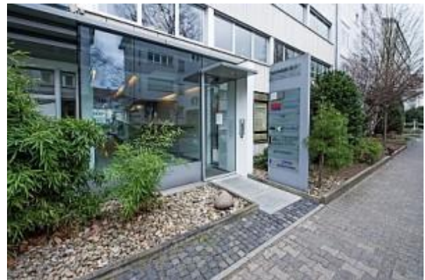
Entrance Bettinastrasse 35

Next to our office, we have a couple of parking spots which can be used by our visitors.